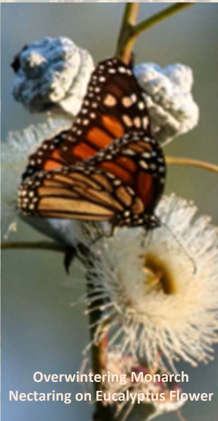
Overwintering Monarch Nectaring on Eucalyptus Flower